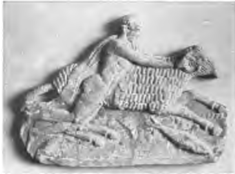
Fig. 84. Phrixus and the Ram.

ALTHOUGH Ath'amas, a king in northern Greece, had two children, Phrixus and Helle, he left his first wife and married again. This second wife, like the traditional step-mother wish-